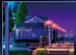
Fire of Scorpion